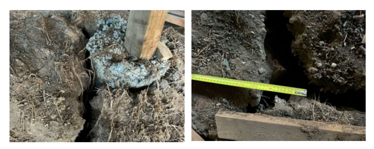
Figure 3: Ground cracking under the dwelling around piles