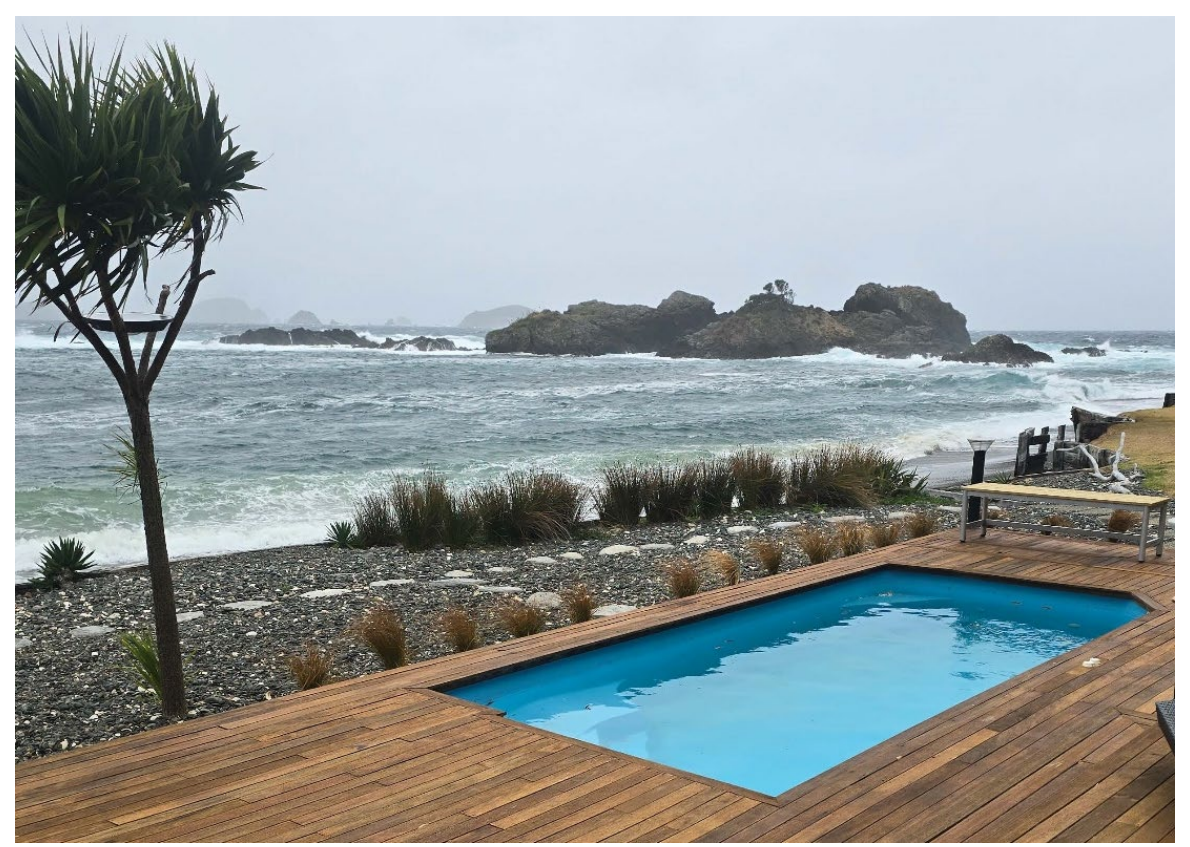
Figure 1: The pool

This determination considers the authority's decision to issue a notice to fix for an existing pool on an offshore private island that does not have a physical barrier to restrict access by unsupervised young children. The determination considers whether the owner is required to comply with section 162C of the Building Act 2004 and whether a waiver is appropriate in the circumstances.