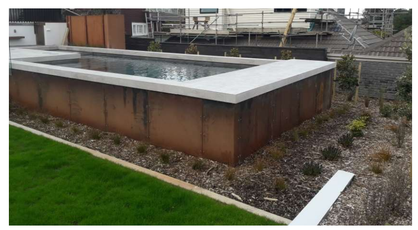
Figure 1: Photograph with south end of pool in foreground