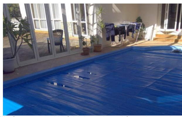
(b) One external bi-fold door viewed from the pool room