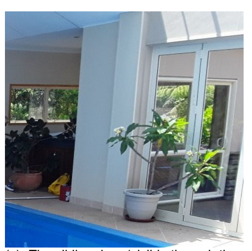
(c) The sliding door (visible through the external bi-fold door)