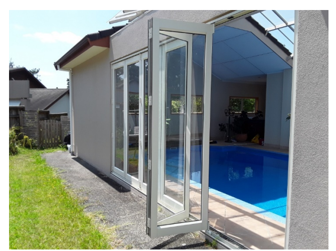
(d) The other external bi-fold door viewed from outside