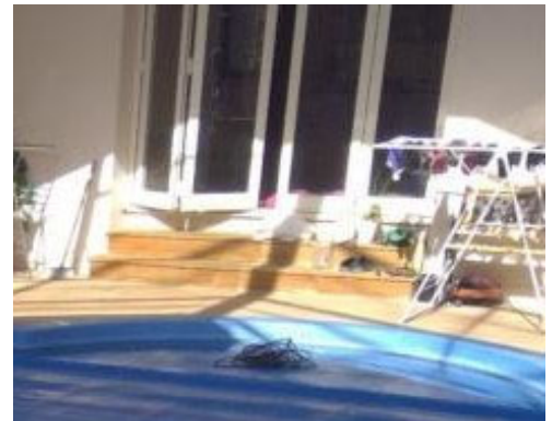
(a) The internal bi-fold door viewed from the pool room