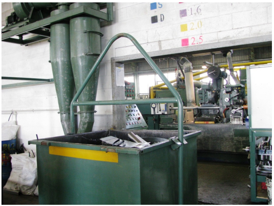
Photo 1: Extract systems not specifically mentioned in compliance schedule