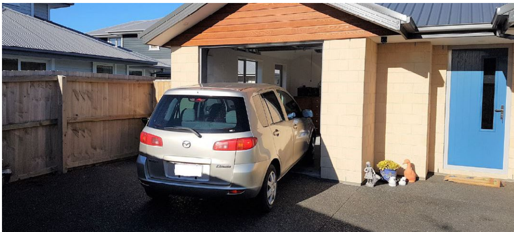
Figure 1: Forward manoeuvre into the garage (Figure 3 from the experts' report)